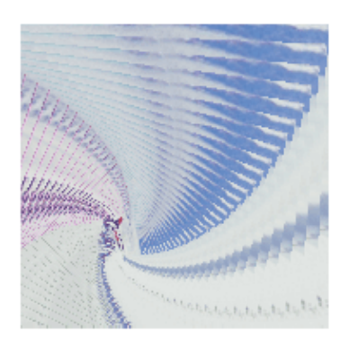
Figure 9. Affine Transform

The processing time can cause latency in the controls. As a result, the control panel has an option for continuous update, during slider manipulation.